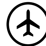
Manchester International Airport 17 miles