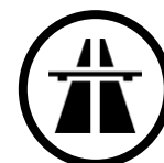
J9 M56 Motorway 8 miles