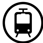
Lostock Train Station 0.8 miles