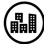
Manchester City Centre 25 miles