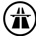
J19 M6 Motorway 3 miles