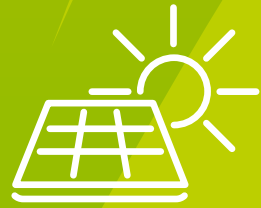
Roof-mounted Photovoltaic Panels