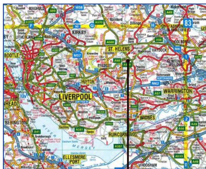
St Helens, WA9 5EA